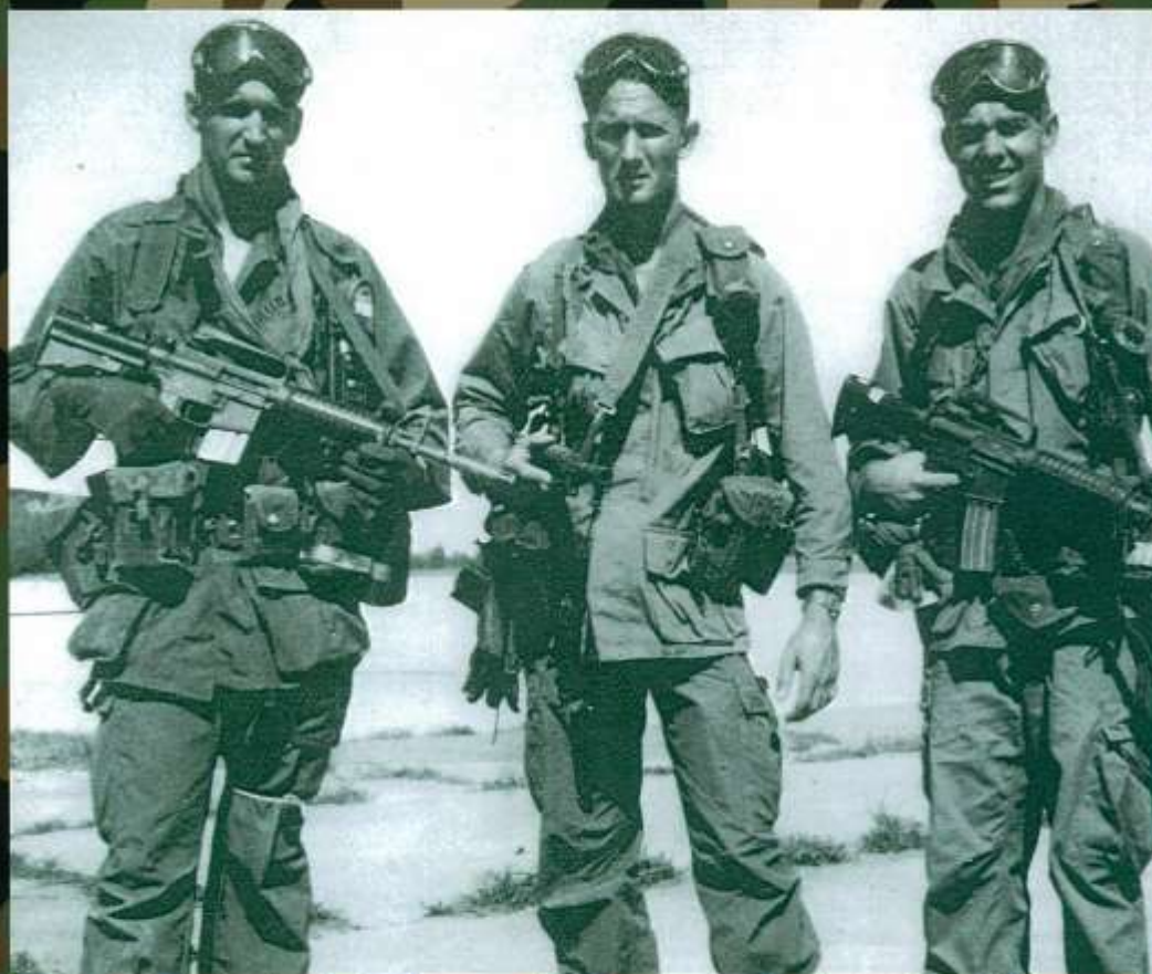
Blue Boy 3